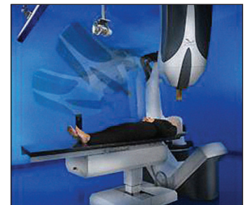
CyberKnife (Overlook and Stamford)