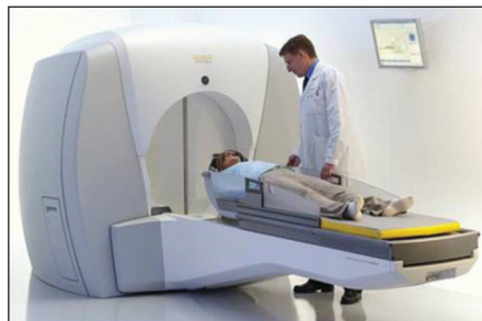
Gamma Knife Perfexion (Columbia)