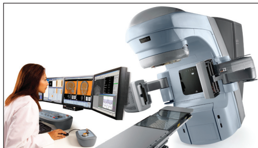
X-Knife LINAC Radiosurgery (Weill Cornell)